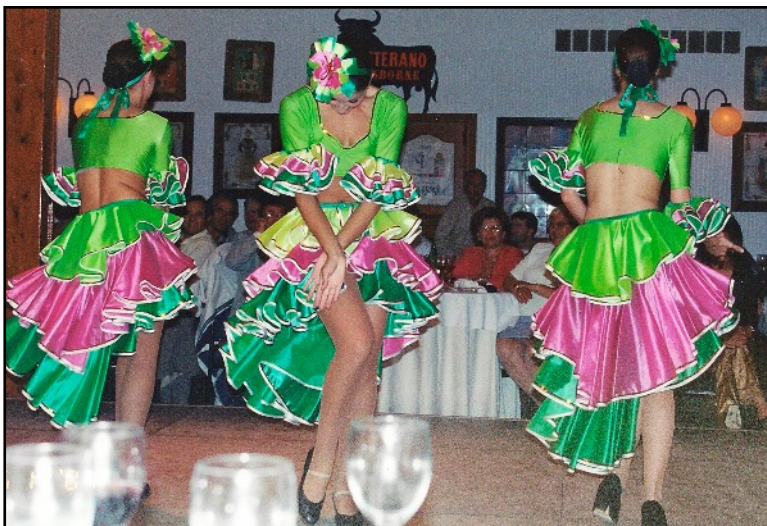
Flamenco dancers will be one of the attractions in Seville, Spain.