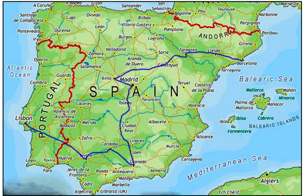
Blue line indicates tour route from Lisbon to Barcelona.

Cost of the trip is based on 32 passengers. If you plan to go, email kirktour@gmail.com and let us know.